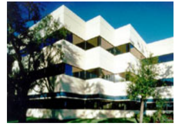
@ MainSail Complex In SunForest II

CHOOSE. LEARN. SUCCEED. 5110 Eisenhower Blvd Suite 300 Tampa, FL 33634 813-387-3500